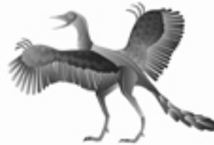
(Archaeopteryx) YES - NO