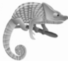
(Iguana) YES - NO