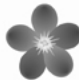
(Flowers) YES - NO