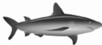
(Megalodon) YES - NO