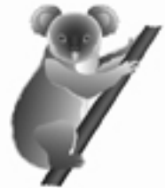
(Koala) YES - NO