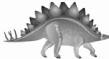
(Stegosaurus) YES - NO