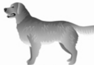
(Dog) YES - NO