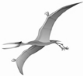
(Pterodactyl) YES - NO