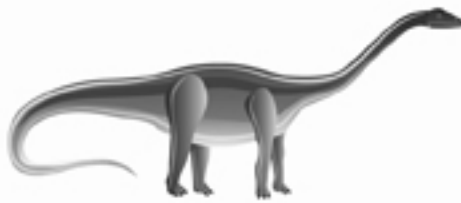
(Diplodocus) YES - NO

Pretend you traveled back in time to the Late Cretaceous Period. Circle YES, if you would see the animal in this time period. Circle NO if that animal is a modern day animal.