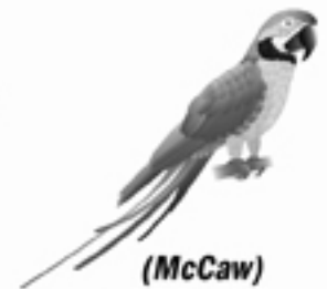
(McCaw) YES - NO