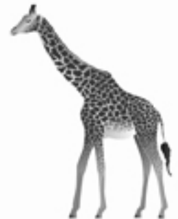
(Giraffe) YES - NO