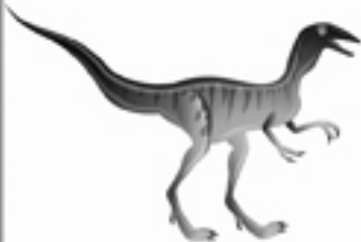
(Velociraptor) YES - NO