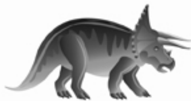
(Triceratops) YES - NO