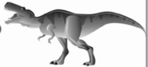
(Tyrannosaurus rex) YES - NO