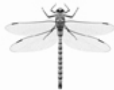
(Dragonfly) YES - NO